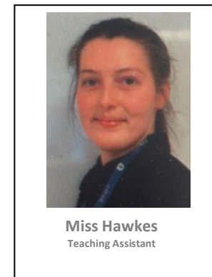
Miss Hawkes Teaching Assistant

We will learn about different fruits and vegetables, how to use cooking equipment safely and finally make and evaluate a delicious fruit salad.